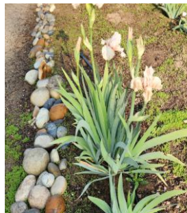
December 6 th : First blooms appear in the new Iris Garden!